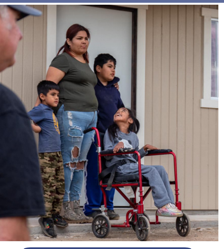
Building Houses for Families

Your support provides family assistance so parents can support their own children. Keeping families with special needs kids together is our calling. In Mexico there is cultural pressure to put special needs kids in orphanages. Instead we help parents to take care of their own children by helping establish basic housing, providing food and supplies as well as coordinating daycare so parents can work.